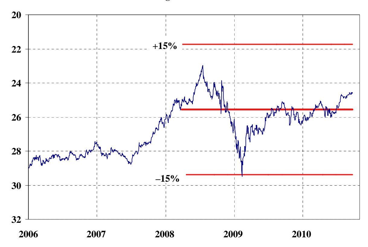
Chart 2.1: Nominal CZK/EUR exchange rate

Note: In the chart, an upward movement of the exchange rate means appreciation of the koruna vis-à-vis the euro. The hypothetical central parity is simulated by the average exchange rate for 2008 Q1.